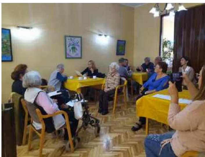
Healthy ageing session, Subotica, Serbia, October 2022

Recreational activities included different creative ideas, such as cooking painting but also walks in