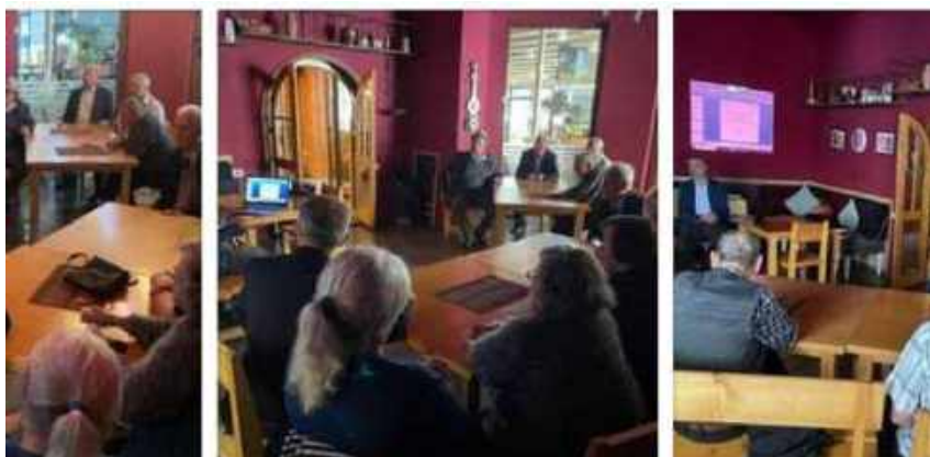
MOSHA Network meeting

The meeting of MOSHA network of organisations of older persons was organized as planned on 1 st October 2022, the International Day of Older Persons. Three national organisations of pensioners, two clubs of older persons of Tirana and five non-governmental associations, all MOSHA members, participated. The focal point for ageing at Ministry of Health and Social Protection was also present. The meeting was organized by the project partner AAGG who coordinates the work of MOSHA