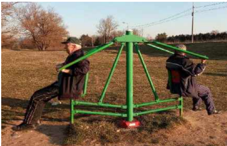
Healthy ageing session in Niš, Serbia, November 2022

The activities under this heading are organised through groups of older persons/ persons with disabilities that meet once per week in the regional centre and do agreed activities in between the meetings. The group work provides regular activity for persons who are able to come to meetings and have interest in being engaged in more structured activity at meetings and between meetings.