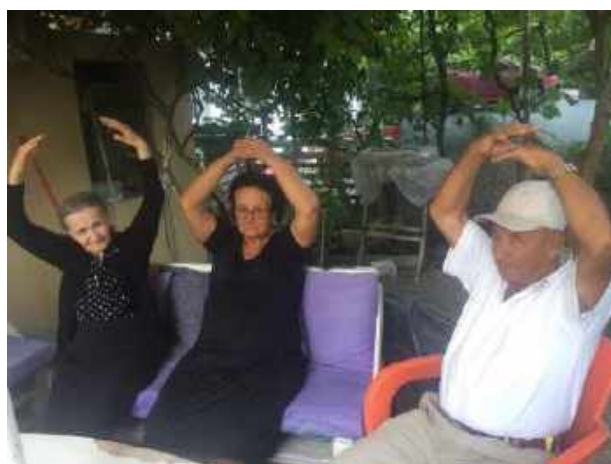
Healthy ageing session in Shijal, Albania

The topic of abandonment emerged in several groups since many beneficiaries live alone and far from their family. Different group exercises were conducted to encourage behavioural change, such as